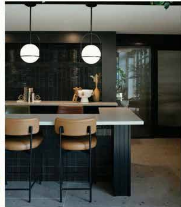
GRANITE CLAD SERVING COUNTER