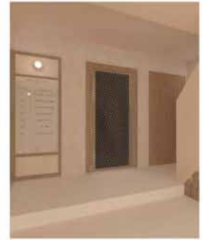
INTERIOR VIEW (RESIDENTIAL DIRECTORY / LIFT / SERVICE DOOR)