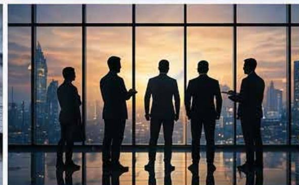
Experienced Multidisciplinary Team