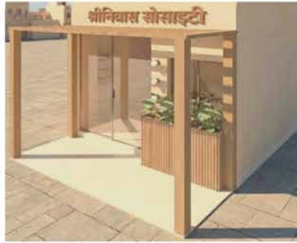
DAYTIME ISOMETRIC VIEW