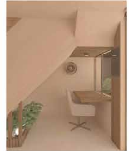
WATCHMAN'S SEATING AREA (WAIST SLAB UNDERSIDE)