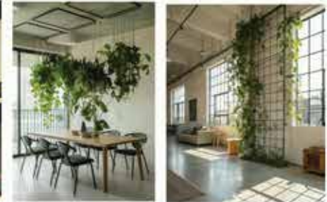
PLANTERS INTEGRATED IN DESIGN