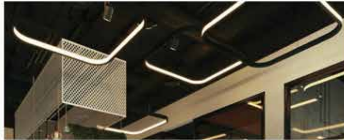
DARK EXPOSED CEILINGS WITH HANGING LED LIGHTS