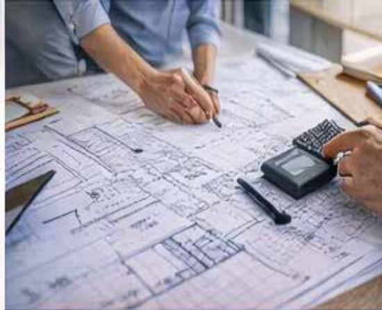
ENGINEERING & OPTIMIZATION