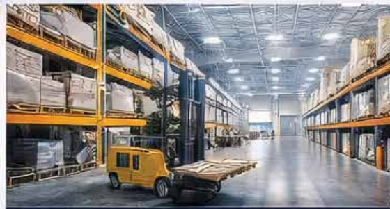
INDUSTRIAL & WAREHOUSING