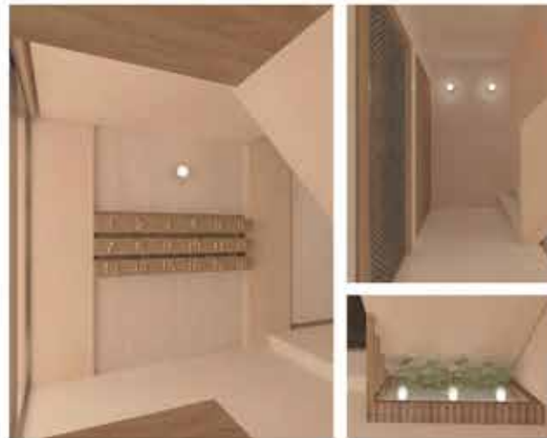
LETTERBOX UNIT / RIGHT SIDE WALL / WAIST SLAB UNDERSIDE DESIGN ELEMENT