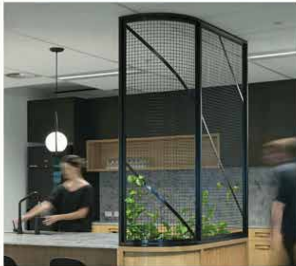
DARK METAL MESH PARTITIONS