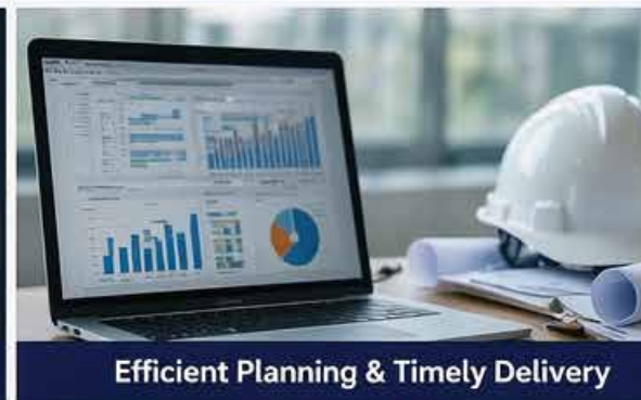
Efficient Planning & Timely Delivery