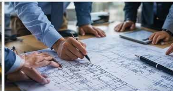
Fast-Track & Live-Site Capability