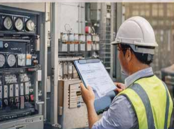
TESTING & COMMISSIONING