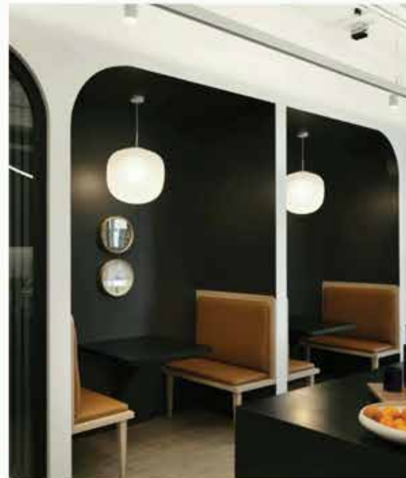
BOOTH SEATING (ADDS VARIETY TO FURNITURE LAYOUT)