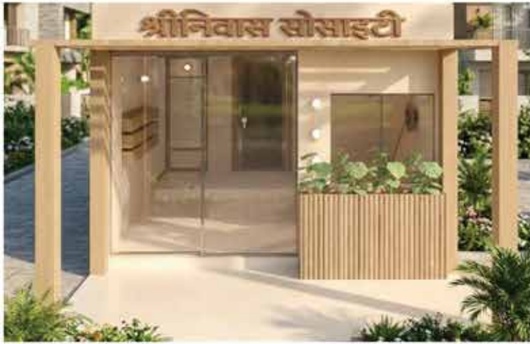
FACADE DAYTIME VIEW