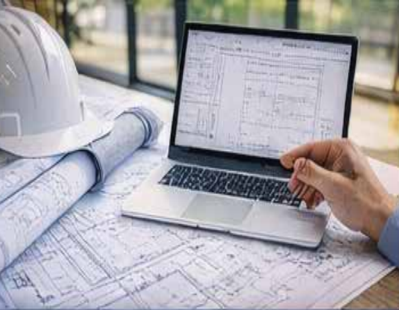
PLANNING & DESIGN