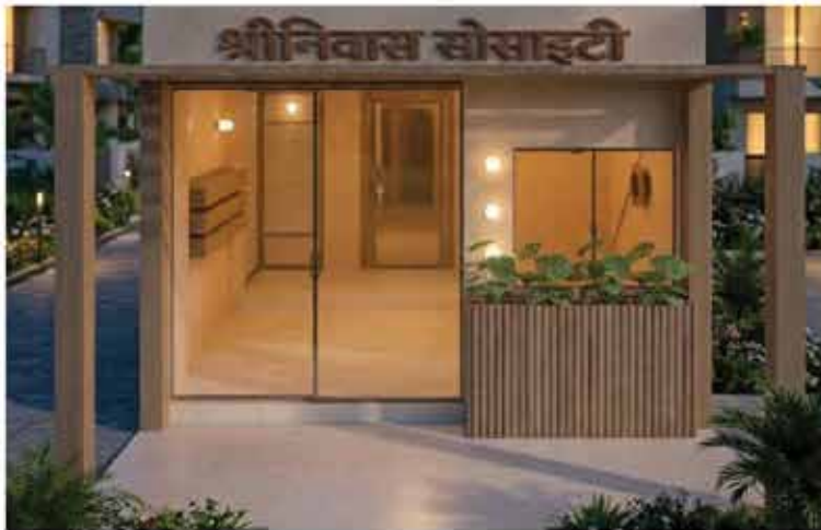
FACADE NIGHT - TIME VIEW