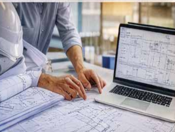
EXECUTION & MANAGEMENT