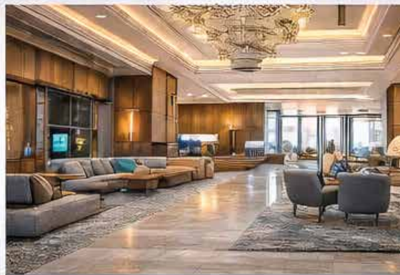
SCHOOLS AND COLLEGES