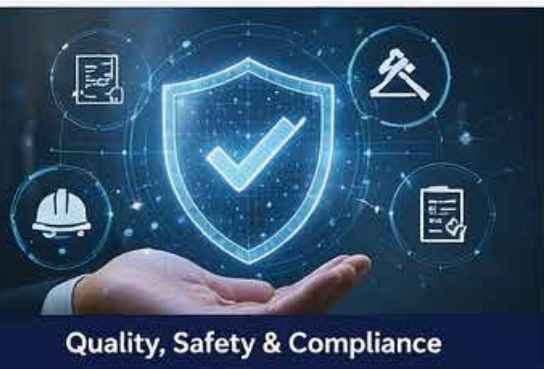
Quality, Safety & Compliance