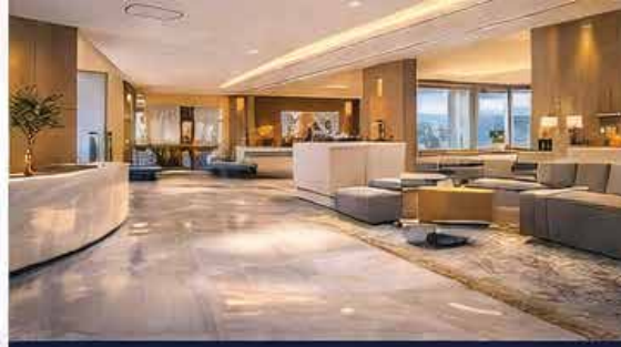
COMMERCIAL & OFFICE SPACES