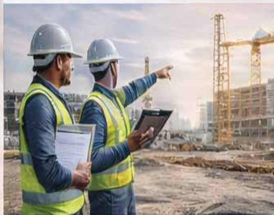
QUALITY & SAFETY