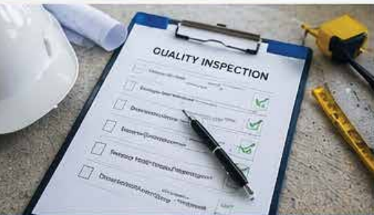
Strong Engineering & Execution